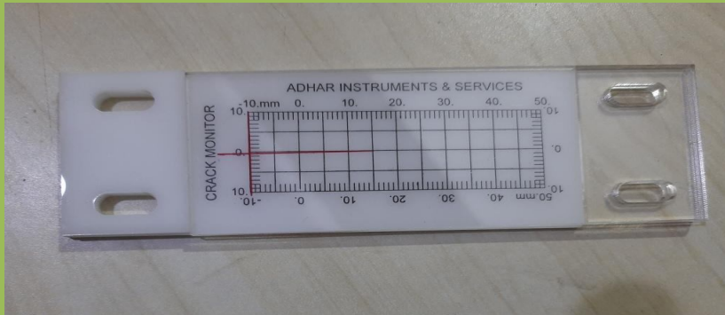
Mechanical Crack Monitor